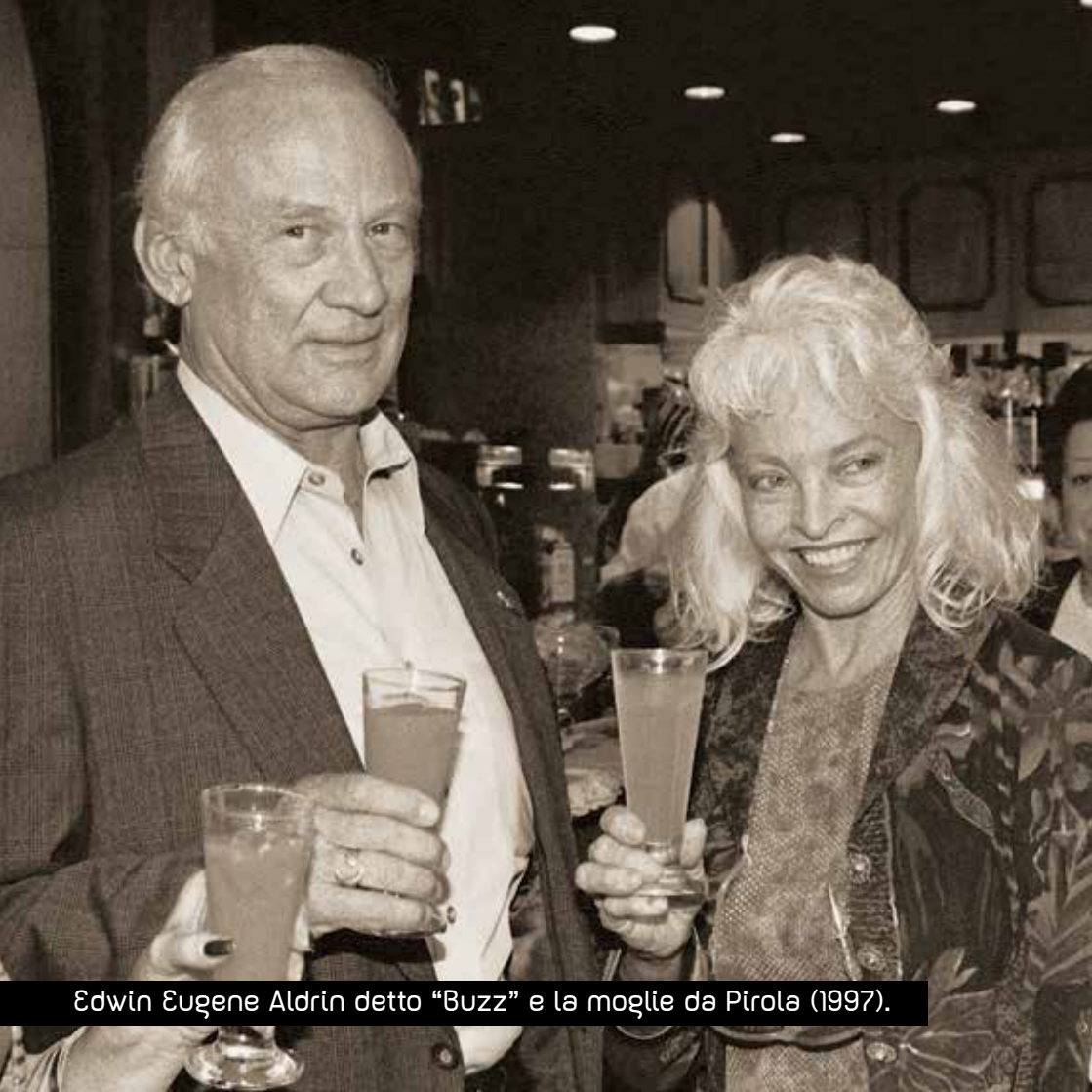
Edwin Eugene Aldrin detto "Buzz" e la moglie da Pirola (1997).

APOLLO 11 - Liqueure aperitivo dal 1969.